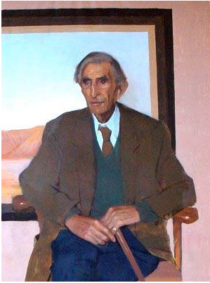
Sir Wilfred Thesiger