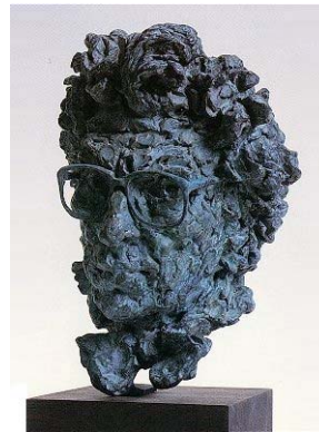
Lord Gowrie, PC