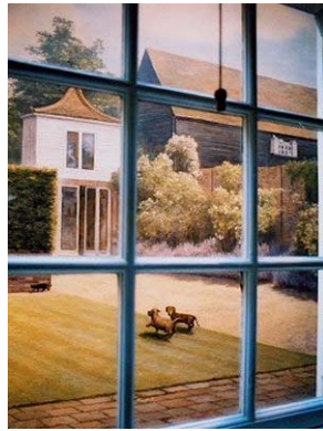
Garden Mural Through Windows