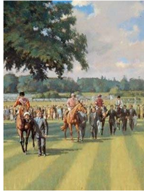
The Winners Enclosure