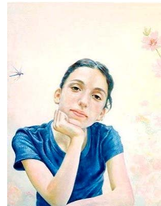
Blue Demioselle - Summer