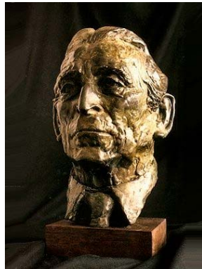
Rt. Hon. Viscount Tonypandy