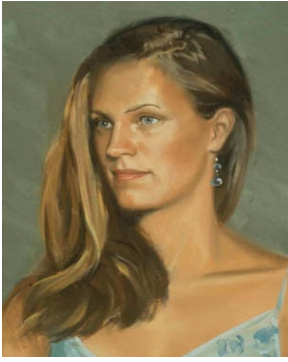
Lady in a Blue