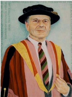
Senior Fellow of the Royal College of Art