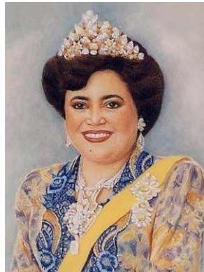
The Queen of Brunei