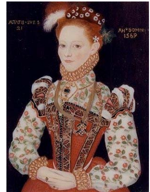
Copy of a Holbein painting